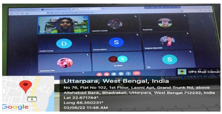
Special Lecture being delivered