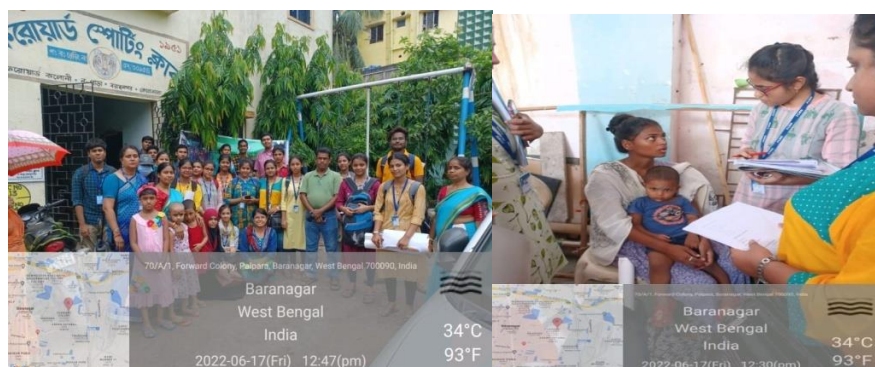
Community Field survey at ICDS Centre, Noapara, Baranagar