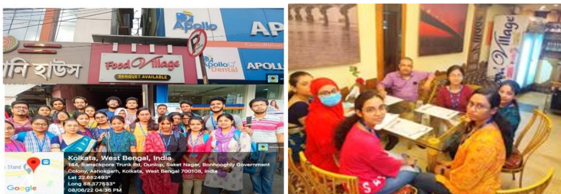
Visit to Food Village- a multi cuisine restaurant at Dunlop (COURSE CODE- FNTSSEC02M)