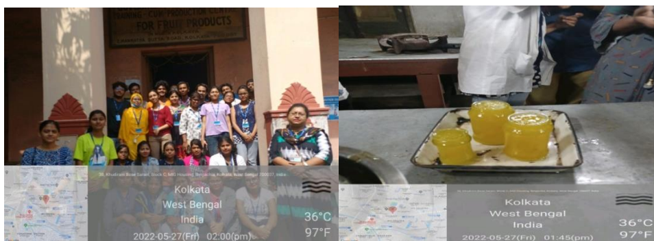
Field training on Food processing T& C North Kolkata, Govt. of West Bengal (COURSE CODE- FNTADSE04P)