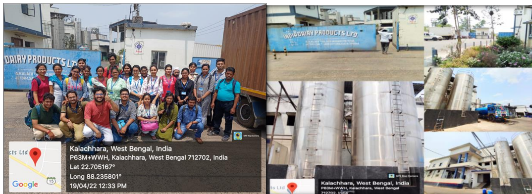
Visit to Amul Dairy, Dankuni Unit